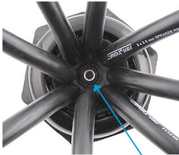
Moulded nut to insert/pull out the rubber grommet, using the removal tool

SYNTAX® SSX SPIDER 19 pin connector is an alternative version of the SSX 19 pin standard, studied to get simple managing of break-in and break-out operations. The special 8-way rubber grommet, fitted in the cable gland terminal, guarantees optimal cable retention and a perfect watertight seal IP67 necessary for outdoor use. Supplied with 8 SYNTAX® MAINFLEX cable leads, it represents the best solution to meet the requirements as for handling and waterproof IP67 protection.