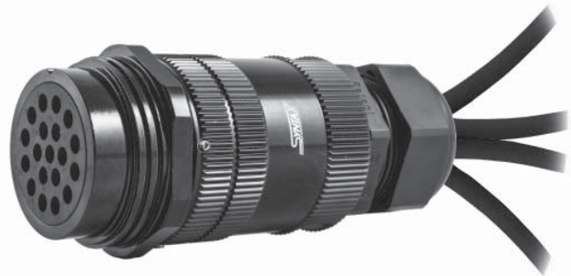
SSX 16 pin motor spider connector with M40 4-way grommet