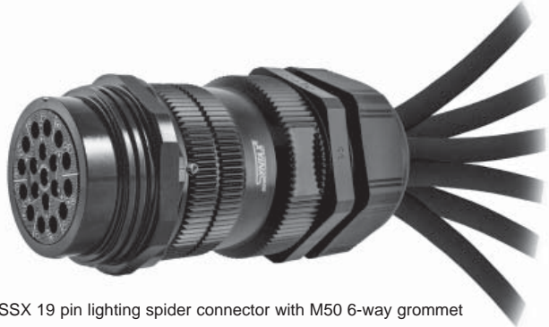
SSX 19 pin lighting spider connector with M50 6-way grommet