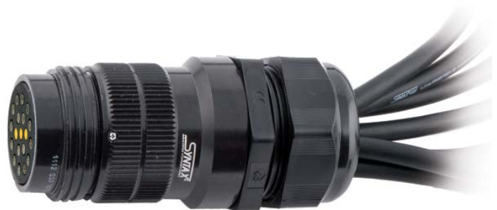
SSX 16 pin speaker spider connector with M50 8-way grommet